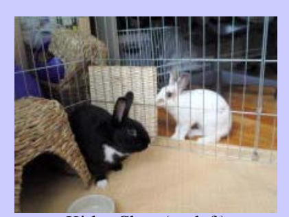
Kirby Chen (on left) and neighbor