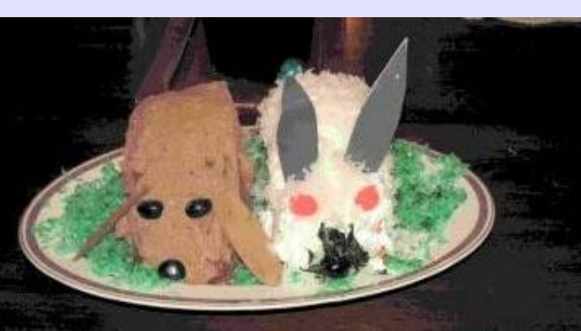
Looks Just LIKE Them!!!