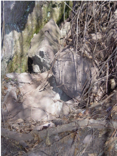
This desolate location offered great hiding spots for our bunny.