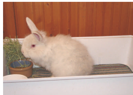
Safe and warm, 'Magic' takes in his new surroundings.....