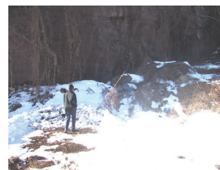
A first look at the daunting task, as Ernesto indicates where the bunny had been seen.

was spotted. A covering of snow also made finding a white bunny very difficult.